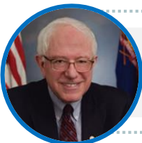
Senator Bernie Sanders

"We must enact bold solutions to save our planet from the disastrous effects of climate change by passing the Green New Deal to save the planet and create millions of new jobs."