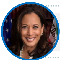
Senator Kamala Harris

"The Green New Deal is a bold plan to drastically shift our country to 100% clean and renewable energy. We will repair our country's crumbling infrastructure, upgrade buildings across the nation, and dramatically cut greenhouse gas emissions."