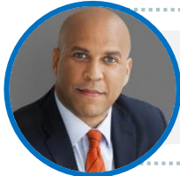
Senator Cory Booker

“We must take bold action on climate change & create a green economy that benefits all Americans. Excited to support a #GreenNewDeal.”