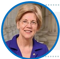
Senator Elizabeth Warren

The GND will likely play a role in the 2020 democratic presidential primary