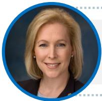
Senator Kirsten Gillibrand

The GND will likely play a role in the 2020 democratic presidential primary